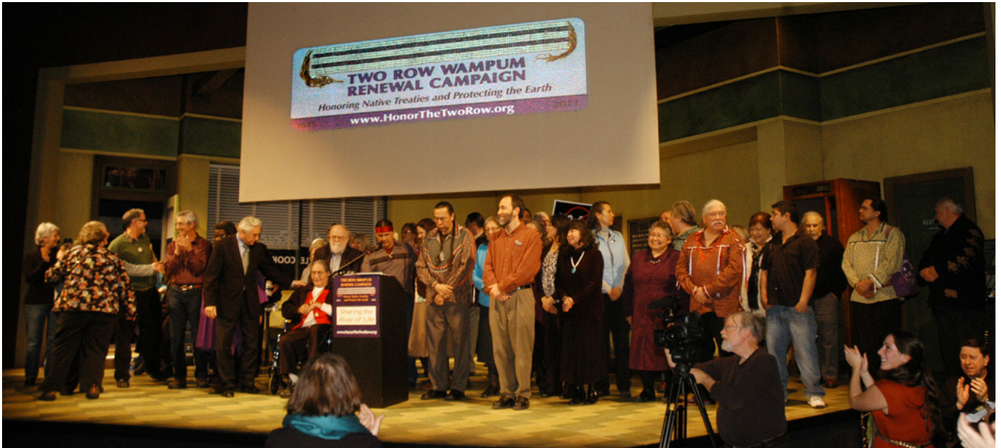
At the end of the presentation of projects working in the spirit of the Two Row at Sharing the River of Life on February 11, the stage was full of collaborators.