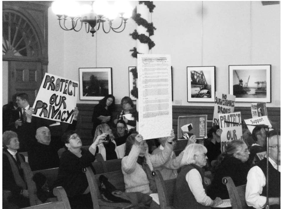
People show their support for the anti-surveillance drone resolution at the December 16 Syracuse Common Council meeting.

On January 8 , New Yorkers will converge outside of Gov. Cuomo's State of the State address to call for a frack-free, renewable energy-powered future. Sign up for one of the buses going from Syracuse to Albany for the protest. Organizing is also underway to prevent the construction of a gas pipeline running from Broome to Onondaga County. To learn more and to get involved, contact Emily Bishop, emily@nyagainstfracking.org .