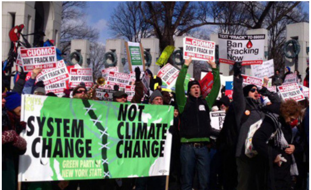
Forward on Climate Rally in Washington DC, February 17 2013.

representing the countries of the world gather to discuss the future of the planet. And every year, it’s more obvious that the richer countries—those who have polluted their way to economic growth and development and are responsible for the bulk of historical greenhouse gas emissions—are unwilling to adequately reduce their emissions to the levels necessary to prevent a rise in global temperatures.