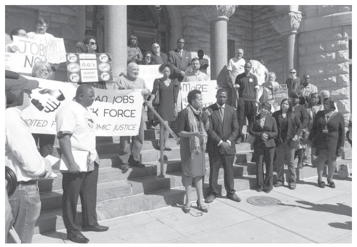
Rally and press conference at the steps of City Hall urging the passing of the Residency Employment Ordinance.

1. With Legal Services of Central New York, we are creating a Racial Equity Impact Statement (REIS) to deliver to the New York State Department of Transportation (NYSDOT) during the Draft Environmental Impact Statement's public comment period. The REIS is a tool which documents racial inequities by examining the historical record along with quantitative and qualitative data. Besides employing census data, publicly-funded construction project datasets and an asset-based survey, we