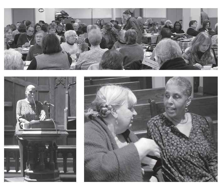
SPC's Birthday Dinner on March 24.

Take the petition in this PNL issue (for subscribers) and collect signatures from your family, friends, neighbors and colleagues and return it to the Syracuse Peace Council or mail it to the UJTF (the address is on the petition). You can pick up more copies at SPC, or download the petition from www.ujtf. org. Even partially-filled pages help. Suburban residents can also sign. Together we can make a difference!