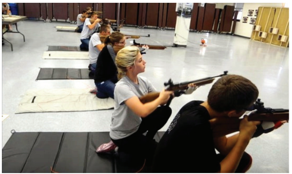
Students at Marjory Stoneman Douglas High School practice in the school's firing range.

JROTC programs in US schools are run by the Army, Navy, Air Force, and Marines. The school shooting programs are regulated by the Civilian