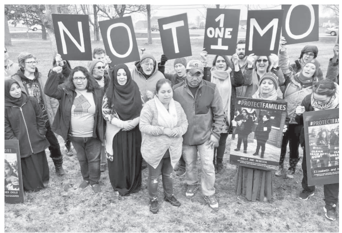
Rally in Batavia against the detention of women in the Batavia Detention Center.

We are happy to report that due to the quick mobilization of the community and the workers, one week later the workers received $1,600 from their employer to pay for their stolen