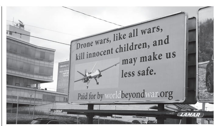
Anti-drone billboard in Syracuse.