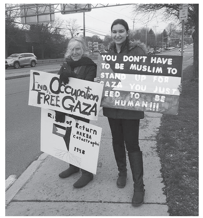
SPC's Justice for Palestine Committee organized demonstrations in DeWitt, NY for five Fridays in April and May. These were in solidarity with Gaza's Great Return March.